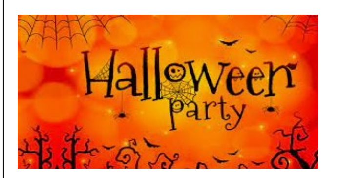
Friday, October 28th

Or Scrambled Eggs with Bacon or Sausage Home Fries, Toast, Fresh Fruit and Coffee